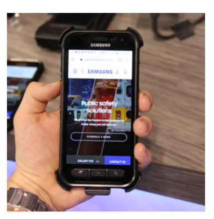
Samsung's new XCover Field Pro smartphone. – OFFICER MEDIA GROUP

Now, with your new phone – imagine not using a "mobile" version of your CAD/RMS but using your smartphone as your core computer system. Samsung's DeX basically turns your Android smartphone into your mobile data terminal with the software you would need installed. Use a larger monitor in a rugged mount to keep computer work easier on the eye. Likewise, take the smartphone out and bring it to your desk in the