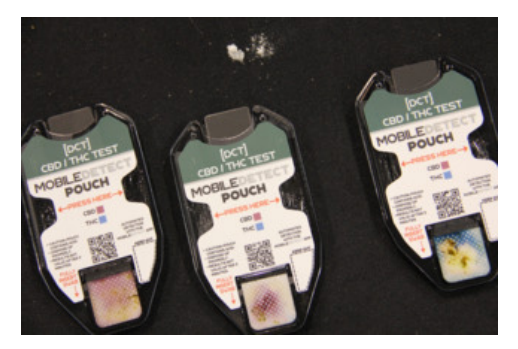
While DetectaChem's pouches have a visible reaction, an app on your smartphone can give you detailed results.

With zero tech at all, SwabTek's solution is similar to the litmus tests you may remember from high school chemistry. The SwabTek narcotics field test is basically of two parts: one a paper strip with dry reagent test zones and second, pre-treated swabs. This conveniently avoids the reagent dropper bottles, breakable ampules or pressurized spray cans—officers simply swipe the