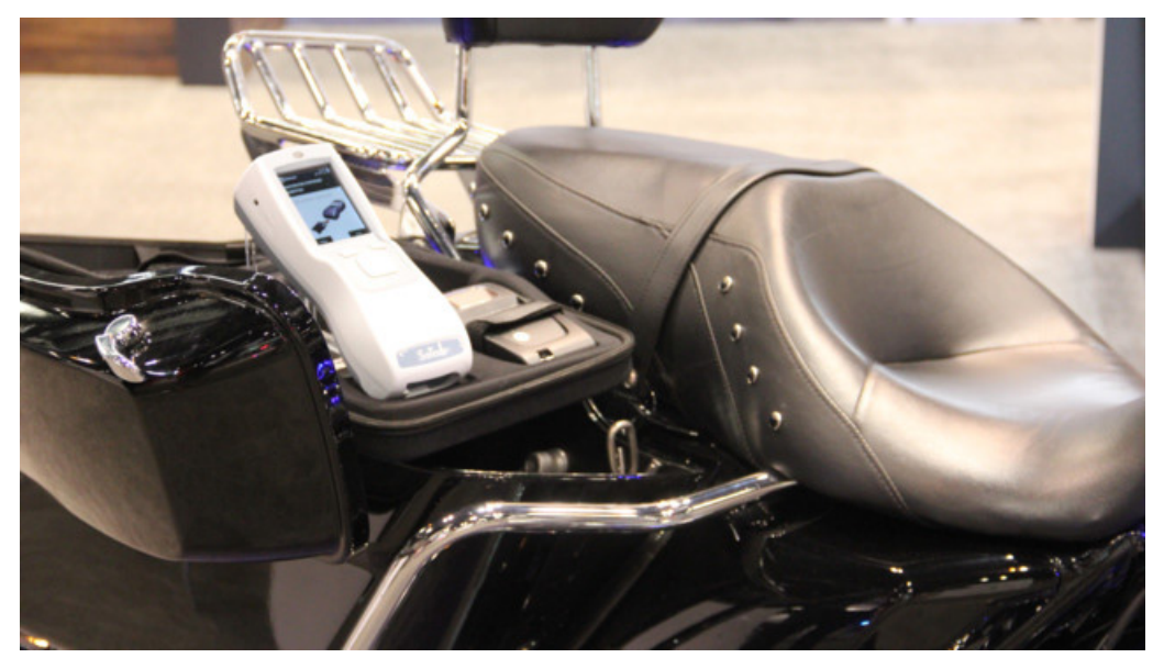
The Abbott SoToxa handheld unit has a small footprint and fits well for motor patrol. See here mounted on a Harley-Davidson.

But officers need not only smartphones and tablets, companies are also working hard on making presumptive tests more convenient and user-friendly each year. Traditional test kits have a few inherent faults in their design: fragility and the potential of disturbing the substance. A handful of companies had their handheld test kits on display – each with varying degrees of technology but all of them alleviate a significant amount of guesswork.