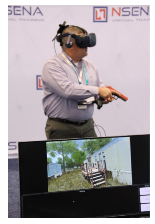
One attendee trying out NSENSA's VR training system. The firearm controller was specially designed for the system. A tracking sensor sticks out from where the magazine would be.

The biggest drawback? You are wearing a helmet. It's something you can forgive while in session as the immersion takes over your senses, but one you won't forget.